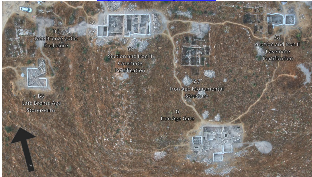
Aerial view showing some of the excavated Areas

The main feature of the Iron Age settlement at the site is the fortification system which surrounds the entire summit. Casemate walls, typical to Iron Age sites in the southern Levant, have been exposed in Areas A1 and B2. The casemate fortifications at Tel Burna were constructed of two parallel walls approximately 2 meters apart, connected to one another by perpendicular walls which form rooms or spaces, known as casemates. Built of large field stones, the outer wall measures 1.5m wide and has been preserved to a height of 3 meters. All in all the entire fortification system would have been approximately 6 meters thick, 280 meters long, and while it stands to a height of about 3 meters, it was certainly much taller in antiquity.