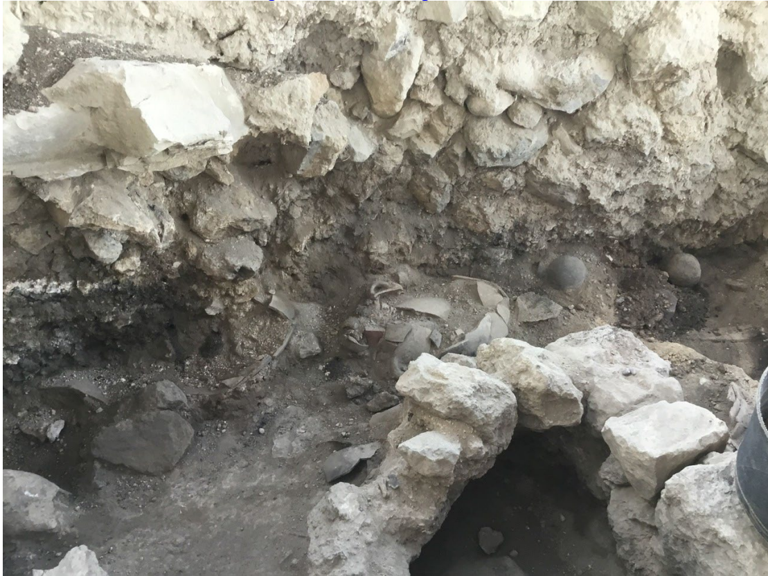
Area B2 Smashed vessels and ashy layer