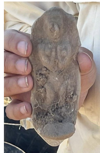
Plaque Figurine Area B3

Area B3, located directly south of Area B1, was originally opened in 2019 to discover the southern extent of the Late Bronze Age cultic enclosure, as well as explore what lay just beyond that. Starting in that first year, we began to uncover multiple Late Bronze Age building units, obviously separate from the cultic enclosure, with walls that were large and well-constructed, complete vessels in situ (including at least seven storage jars from a storage room), and other small finds that gave tantalizing clues as to the function of these buildings. As a result, the goals of our 2023 season centered around exploring these building units further by tracing their layouts and excavating their contents. The 2023 results were just as intriguing as the previous seasons' results and seems to continue to confirm our growing theory that these buildings that we are excavating in Area B3 functioned as a possible governing building that could have been both administrative and residential in nature. The 2023 finds included more rooms, a second storage room/area that contained around 10 complete storage jars in situ , an area that was used for copper-working, and fascinating small finds such as a complete plaque figurine and an incised stone object. In the future, we hope to discover the full plan of this major building(s), carefully excavate its contents, identify its nature, determine how it relates to the cultic enclosure that it sits adjacent to, and continue to