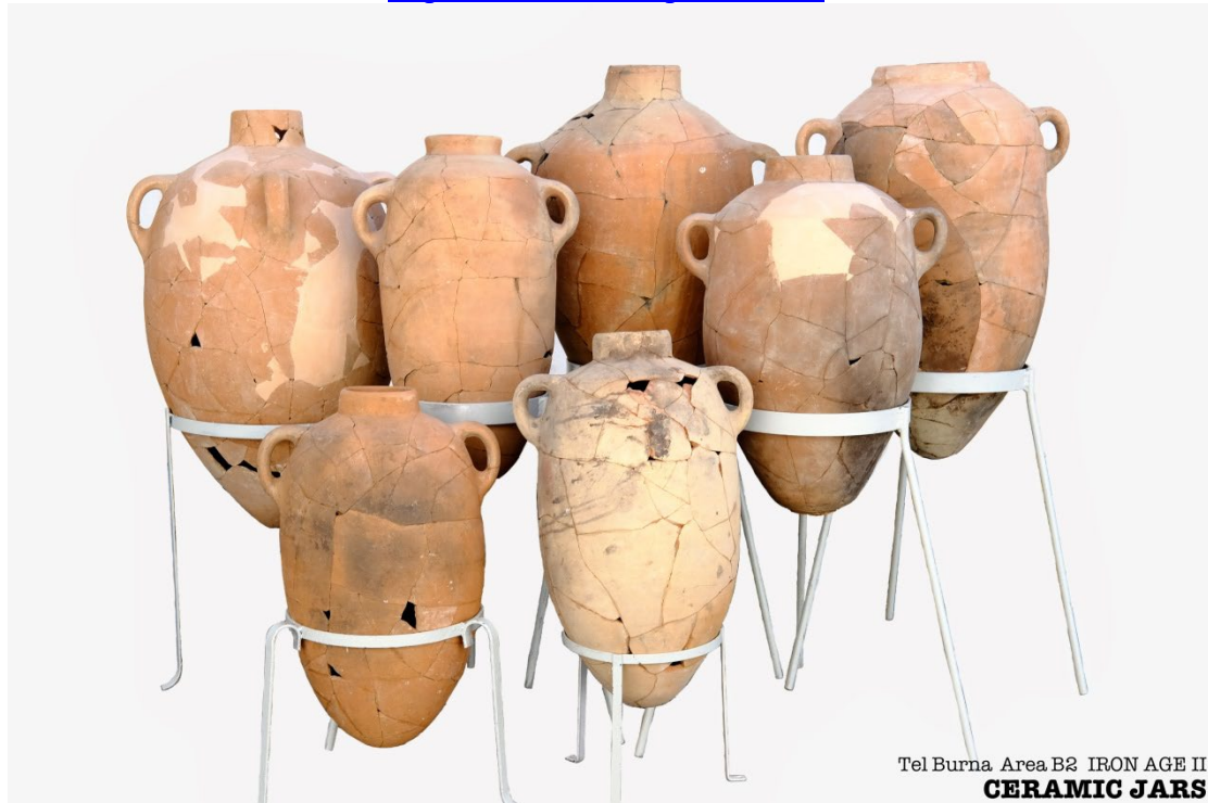
A few of the restored vessels from Area B2