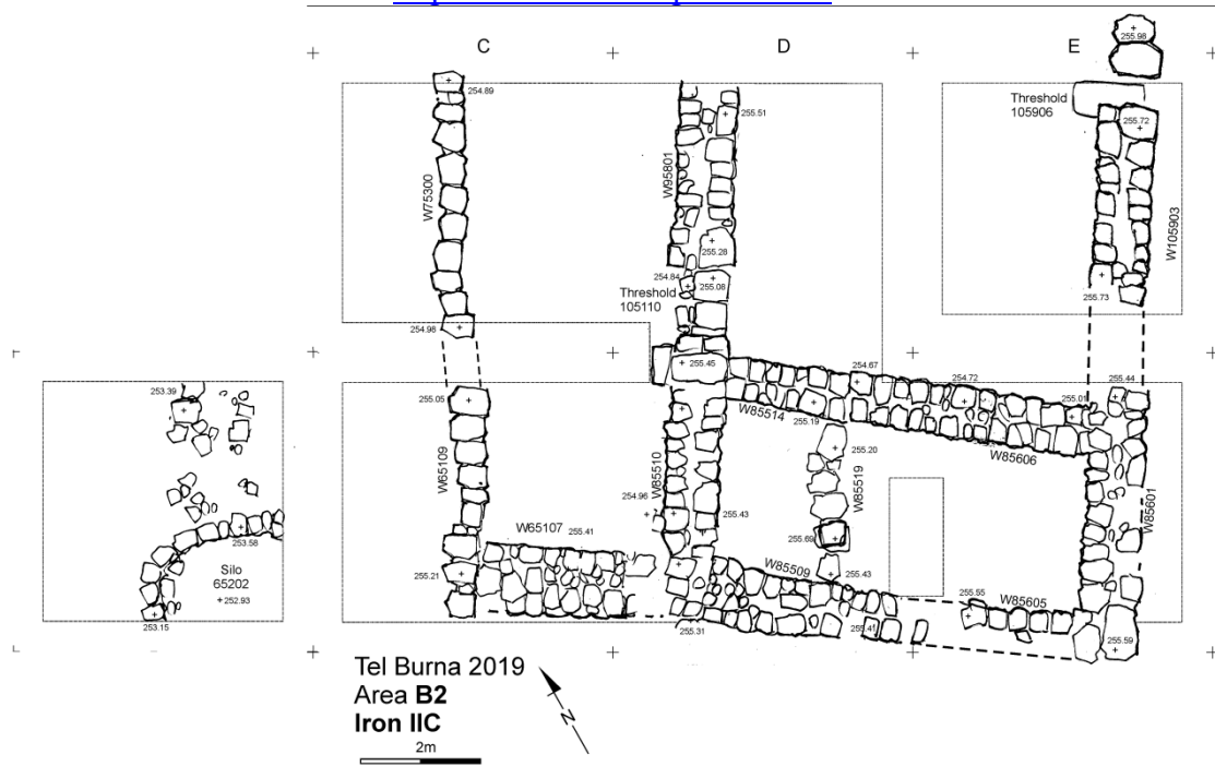
Plan of 7th century B.C.E. architectural remains in Area B2

Thus far, evidence for Late Bronze Age occupation at Tel Burna has been exposed on the western side of the tell in Areas B1, B3 and D, west of Area B2 and the summit. Architectural remains and Late Bronze Age material culture, specifically around the 13th century B.C.E., were discovered in the shallow fill just below topsoil and above bedrock. Excavations in Area B1 exposed a unique structure associated with cultic activities, which included some unprecedented imported wares. Our work in this area has been completed and published in several articles.