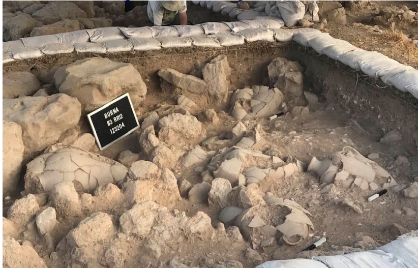
Storage jars in situ in Area B3

Area B3, located directly south of Area B1, was originally opened in 2019 to discover the southern extent of the Late Bronze Age cultic enclosure, as well as explore what lay just beyond that. Starting in that first year, we began to uncover multiple Late Bronze Age building units, obviously separate from the cultic enclosure, with walls that were large and well-constructed, complete vessels in situ (including at least seven storage jars from a storage room), and other small finds that gave tantalizing clues as to the function of these buildings. As a result, the goals of our 2023 season centered around exploring these building units further by tracing their layouts and excavating their contents. The 2023 results were just as intriguing as the previous seasons' results and seems to continue to confirm our growing theory that these buildings that we are excavating in Area B3 functioned as a possible governing building that could have been both administrative and residential in nature. The 2023 finds included more rooms, a second storage room/area that contained around 10 complete storage jars in situ , an area that was used for copper-working, and fascinating small finds such as a complete plaque figurine and an incised stone object. In the future, we hope to discover the full plan of this major building(s), carefully excavate its contents, identify its nature, determine how it relates to the cultic enclosure that it sits adjacent to, and continue to